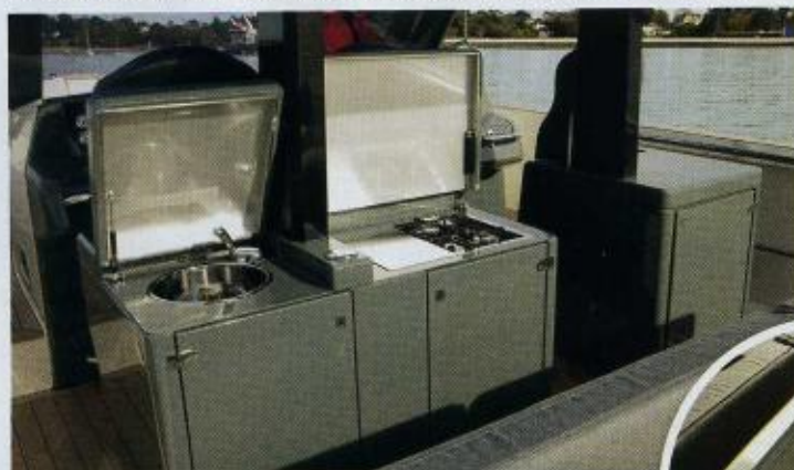
Alfresco cooking: a sink, twin hobs and a fridge sit out on deck

also give the boat a solid look and safe feel, instead the chunky grabrails are on the insides of the hull at waist height. Pop-up stainless cleats add to the streamline design and the feeling that every detail has been thought through.