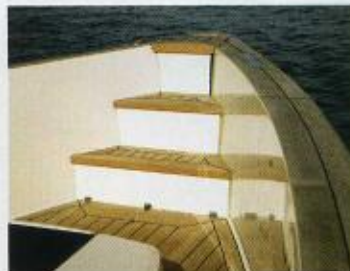
Forward steps make for easy boarding

Before you – or we – put pen to cheque it's worth bearing in mind a couple of points. Firstly, we want Fjord to be happy with the current open boat design. As for the hardtop option, we expect it to be a popular