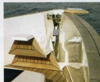
Steps flip back to reveal the anchor

choice among North European and Med boaters alike. But, as the Bavaria 33 on page 34 shows, a hardtop can make a huge difference in both handling and character. Fingers crossed they can keep the same simple but beautiful ethos and deliver a finished design icon.