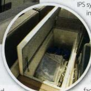
A cavernous locker within the sole

Below decks a basic open-plan layout exudes luxury in the use of quality varnished wood and designer fittings. The single cabin layout has no need for a bulkhead, so the double sofa to starboard and two large his/her full height hanging lockers, either side of the double berth, generate a suite-like atmosphere. There are some design areas that some may struggle with, like the very angular and geometric cabinets. However, considering you can walk around the forward berth