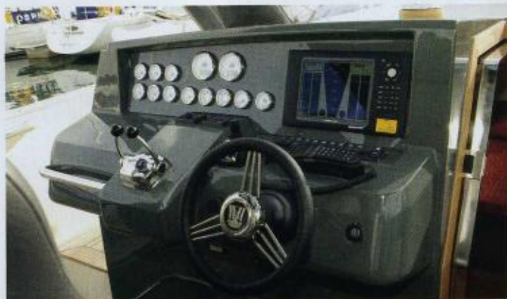
The mighty helm position is well protected by a near vertical forward screen